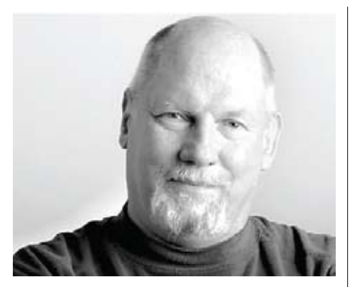
Congratulations on your new appointment as Editor of the Herald. What might be your new responsibilities? What changes can we expect?

Well, I've been the editorial page editor for several years. I continue in that capacity. I am now the editor of the entire newspaper. Add to that the good news that I will be at my desk five days a week rather than the cutback to three of last year. Will there be any changes? I hope so. These are rough times for newspapers. I'm always open to changes for the better – for our readers. I'm an optimist.