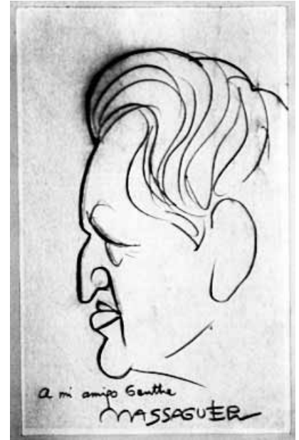
"Caricature of Arnold Genthe by Conrado Massaguer from Library of Congress Prints and Photograph Division."