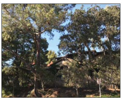
Sixteen trees on Eighth near Scout House could be lost to build a sidewalk of questionable value. Is this a solution in search of a problem?

a mediocre C grade in the American Lung Association's 2018 ratings of air quality. Salinas and Monterey also received C's, while the other cities in the county got F's. The ALA grades for regulating smoke-free outdoor air quality, regulating smoke-free housing, and regulating the sale of tobacco products. Can't we do better?